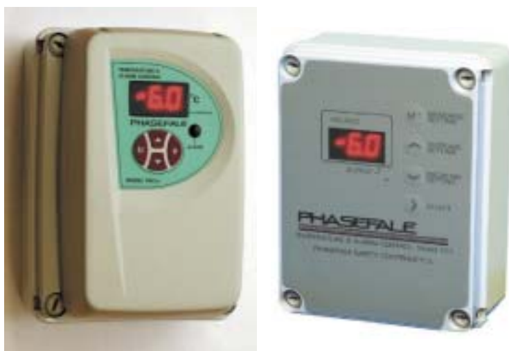
New Style TACm (left) fitted to old style TACm base