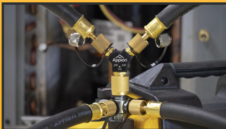
* Extra MH12000EAK hoses sold separately