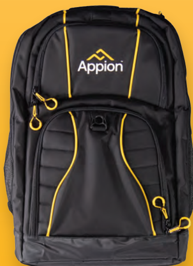
The SPDKIT-V includes the New Appion MegaFlow Tool Bag

NIST-traceable results. All connections made with 1/4in FL fittings. Contact Appion Inc. for more information.