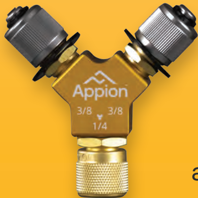
Designed for High Pressure Refrigerants

Featuring the NEW MegaFlow Speed-Y and Filter Dryer Hose