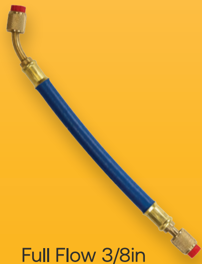
Full Flow 3/8in Filter Dryer Hose

Featuring the NEW MegaFlow Speed-Y and Filter Dryer Hose