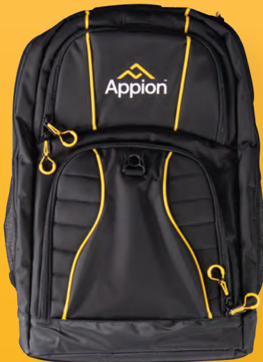
The SPDKIT-R includes the New Appion MegaFlow Tool Bag

A valve core acts like an expansion valve - turning liquid into vapor - which causes the tank to heat up and leads to painfully slow recovery times. Use A VCRT to remove all restrictions for the Fastest Recovery speeds.