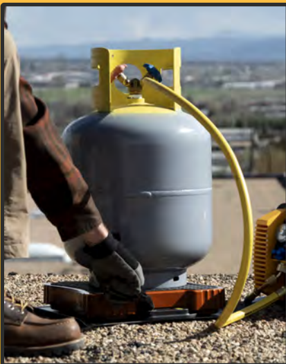
The Ultimate Bluetooth Refrigeration Scale

The WS260 Precision Scale gives HVAC/R technicians everything they need to combat the accuracy requirements of modern systems. Boasting ultra-fine 1g (0.0022 lbs/0.0352 oz) resolution, incredible accuracy, a maximum load capacity of 120kg (264.5 lbs), and a durable aluminum construction. Regardless of the system size, large or small, the WS260 is ready for the job.