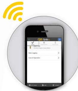
Mobile device paired to the Volt-100 using the CPS Link™ App