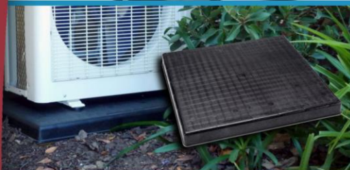
Vulcane Pro Torch