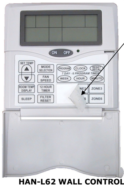
HAN-L62 WALL CONTROL

Peel back sticker to reveal zone select tabs